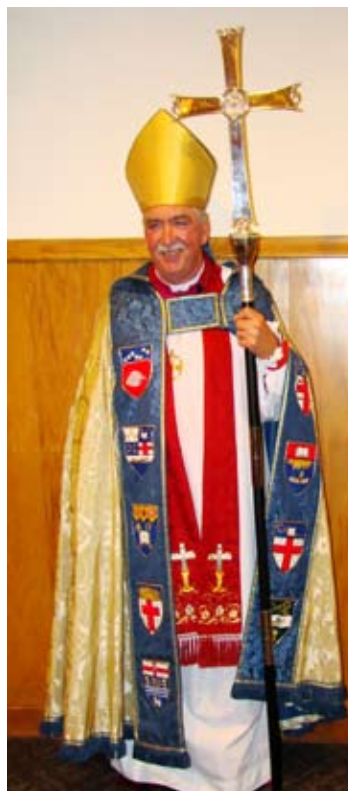
Archbishop David Ashdown was elected metropolitan of the Ecclesiastical Province of Rupert's Land in June, 2009!